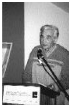
Professor Howard Zinn, author of the seminal A People's History of the United States , was the featured speaker.