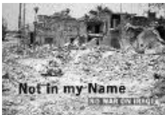
Postcard used in global campaign initiated by IPPNW-Germany.