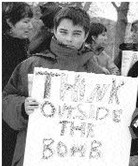
Young US Gulf War II protester.

The Threat of Low-Yield Earth-Penetrating Nuclear Weapons to Civilian Populations: Nuclear “Bunker Busters” and Their Medical Consequences is available on IPPNW's website ( www.ippnw.org ). To obtain printed copies at a cost of $2.00 each, please send the order form on page 11 with payment.