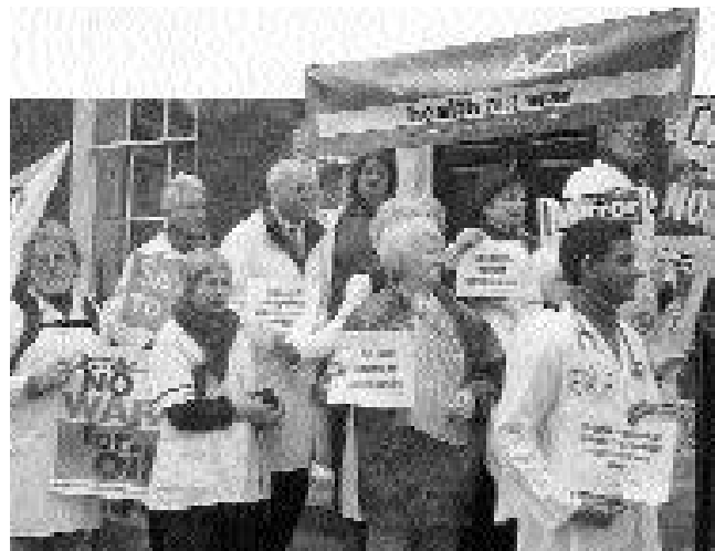
Members of IPPNW’s UK affiliate, Medact, at the million-strong London protest against war on Iraq on February 15, 2003.