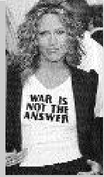
Anti-war activist and musician Sheryl Crow.

Join Grammy Award winning-musicians Sheryl Crow and Bonnie Raitt; Academy Award-winning actors Matt Damon and Michael Douglas; Tony and Emmy Award-winning actress Jane