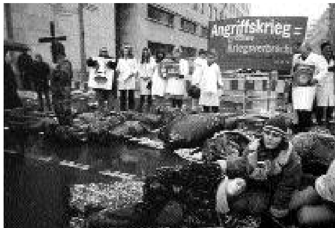
IPPNW-Germany members at body bag action to protest plans for war on Iraq on January 31 in front of the US embassy.

In the United States, medical students from IPPNW's US affiliate, Physicians for Social Responsibility (PSR), convened the 2003 Student PSR Conference in San Francisco, California, "A New Era of Activism," in early March. The conference featured distinguished speakers within the medical and activist communities, as well as workshop sessions concerning the physician's role in promoting global security, protecting the environment and preventing violence.