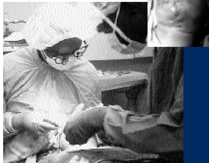
After 9 hours of surgery to repair massive injuries to his face caused by a firearm, this 14-year-old Kenyan boy was left with physical and psychological scars that will never fully heal. These images are part of the One Bullet Story project developed by IPPNW-Kenya.