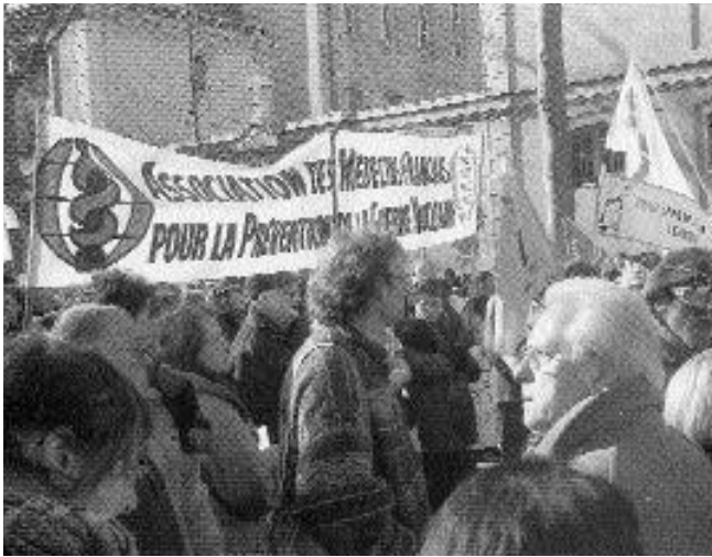
Members of IPPNW-France at Paris protest against war on Iraq on February 15, 2003.

IPPNW affiliates engaged in creative actions to publicize the human costs of war on Iraq. In December, members of IPPNW's Australian affiliate MAPW organized a protest in which 20 people in mock body bags lay outside the British Consulate in Melbourne to draw attention to the deadly consequences of a war on Iraq. Protest organizers urged the Australian and British governments not to support a US-led attack on Iraq.