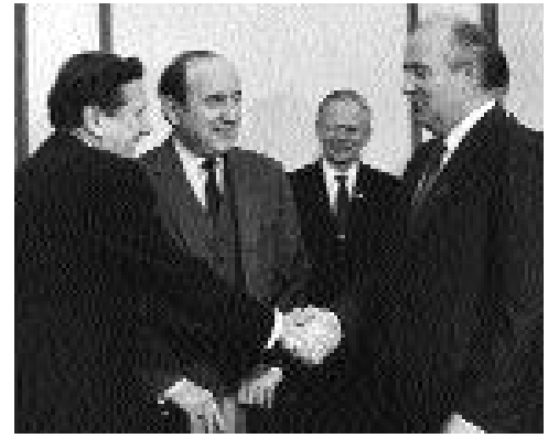
Founding IPPNW Co-Presidents Drs. Evgueni Chazov (left) and Bernard Lown (center) with former Soviet President Mikhail Gorbachev.

Dr. Lown is one of the founding Co-Presidents of IPPNW.